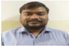
1) PRATAP HOUSE MASTER.