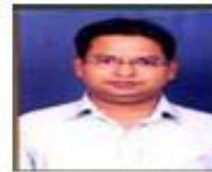
2) SHIVAJI HOUSE CO MASTER.