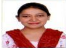
2) SHIVAJI HOUSE MASTER.