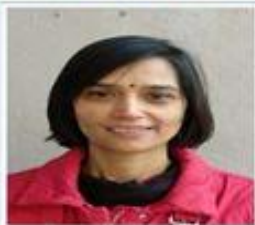
4) TILAK HOUSE MASTER.