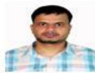
1) PRATAP HOUSE CO-MASTER.